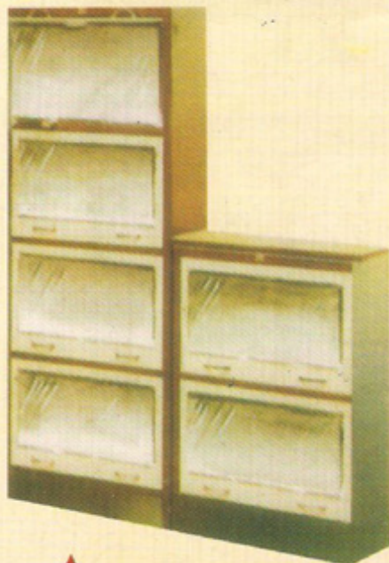
Locker Cabinet (choice of 4 to 24 lockers) 78" x 36" x 19"